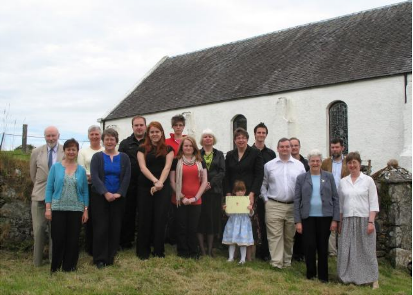
the choir during their recent tour to Appin and Lismore